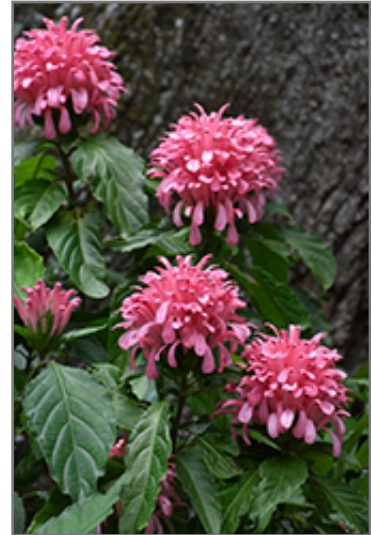
Brazilian Plume Flower flowers