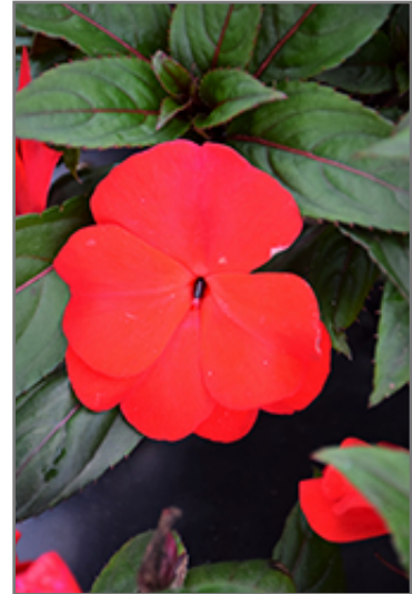
Divine Scarlet Bronze Leaf New Guinea Impatiens flowers

Divine Scarlet Bronze Leaf New Guinea Impatiens is recommended for the following landscape applications;