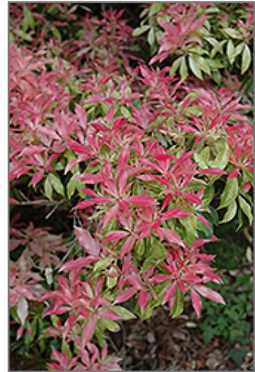
Valley Fire Japanese Pieris foliage