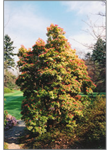
Valley Fire Japanese Pieris

This shrub does best in full sun to partial shade. It requires an evenly moist well-drained soil for optimal growth, but will die in standing water. It is very fussy about its soil conditions and must have rich, acidic soils to ensure success, and is subject to chlorosis (yellowing) of the foliage in alkaline soils. It is somewhat tolerant of urban pollution, and will benefit from being planted in a relatively sheltered location. Consider applying a thick mulch around the root zone in winter to protect it in exposed locations or colder microclimates. This is a selected variety of a species not originally from North America, and parts of it are known to be toxic to humans and animals, so care should be exercised in planting it around children and pets.