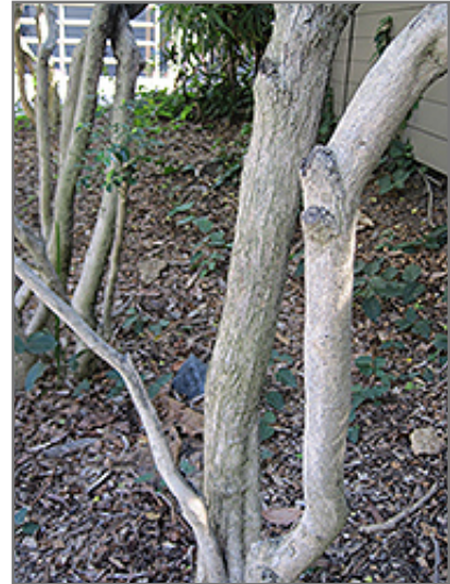
Orange Jessamine bark

Orange Jessamine is recommended for the following landscape applications;