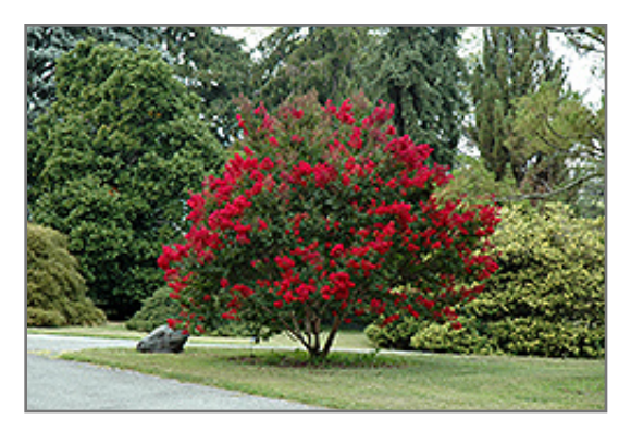
Cheyenne Crapemyrtle in bloom