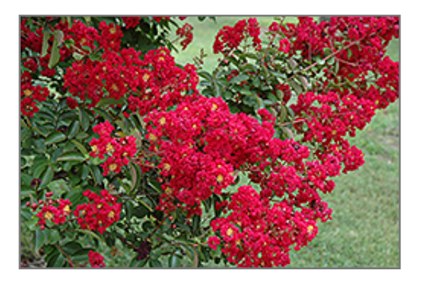
Cheyenne Crapemyrtle flowers

2301 San Joaquin Hills Rd. Corona del Mar, CA 92625 phone: 949.640.5800 www.rogersgardens.com