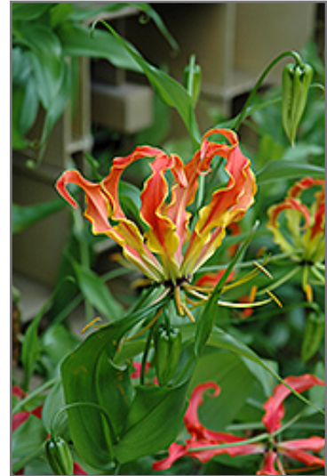
Gloriosa Lily flowers

Gloriosa Lily is recommended for the following landscape applications;