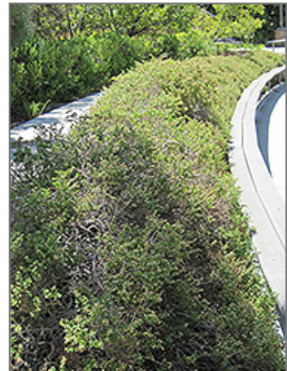
Pigeon Point Coyote Brush