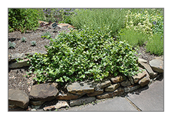
Maid Of Orleans Jasmine

2301 San Joaquin Hills Rd. Corona del Mar, CA 92625 phone: 949.640.5800 www.rogersgardens.com