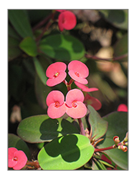
Crown Of Thorns flowers

Crown Of Thorns is recommended for the following landscape applications;