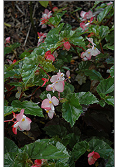
Richmond Begonia flowers