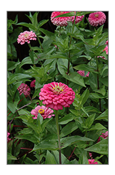
Miss Willmott Zinnia flowers

Miss Willmott Zinnia will grow to be about 32 inches tall at maturity, with a spread of 24 inches. When grown in masses or used as a bedding plant, individual plants should be spaced approximately 18 inches apart. Its foliage tends to remain dense right to the ground, not requiring facer plants in front. This fast-growing annual will normally live for one full growing season, needing replacement the following year.