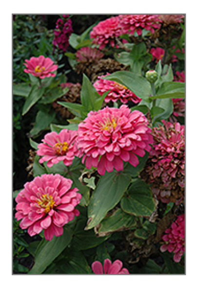
Champagne Toast Zinnia flowers

2301 San Joaquin Hills Rd. Corona del Mar, CA 92625 phone: 949.640.5800 www.rogersgardens.com