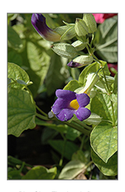
Blue Glory Thunbergia flowers

Blue Glory Thunbergia will grow to be about 5 feet tall at maturity, with a spread of 24 inches. As a climbing vine, it tends to be leggy near the base and should be underplanted with low-growing facer plants. It should be planted near a fence, trellis or other landscape structure where it can be trained to grow upwards on it, or allowed to trail off a retaining wall or slope. It grows at a fast rate, and under ideal conditions can be expected to live for approximately 5 years.