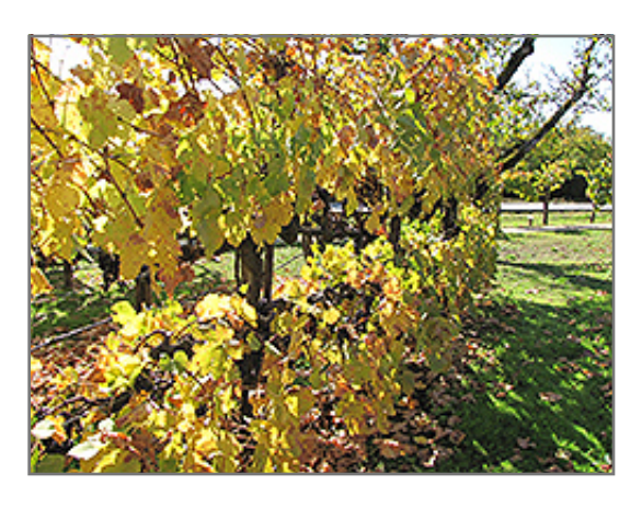
Merlot Grape in fall