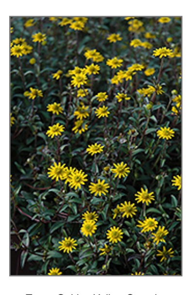
Tsavo Golden Yellow Creeping Zinnia flowers