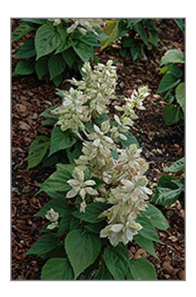
Vista White Sage flowers