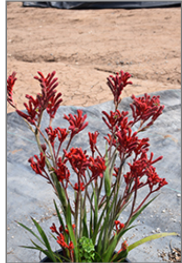
Kanga Red Kangaroo Paw in bloom