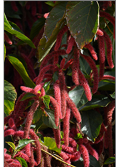
Firetail Chenille Plant flowers