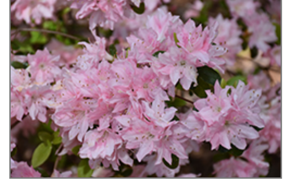
Pink Pearl Azalea flowers

Pink Pearl Azalea is blanketed in stunning clusters of pink trumpet-shaped flowers with white throats at the ends of the branches in mid spring. It has light green evergreen foliage. The small oval leaves remain light green throughout the winter.