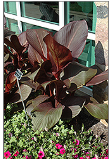
Tropicanna Black Canna

This plant is native to the tropics and prefers growing in moist environments with evenly warm conditions all year round. In our climate, it is usually grown as an outdoor annual in the garden or in a container. If you want it to survive the winter, it can be brought in to the house and provided with special care, and then returned to the garden the following season. In its preferred tropical habitat, it can grow to be around 5 feet tall at maturity, with a spread of 24 inches. However, when grown as an annual or when overwintered indoors, it can be expected to perform differently, and its exact height and spread will depend on many factors; you may wish to consult with our experts as to how it might perform in your specific application and growing conditions.