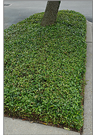
Asian Jasmine