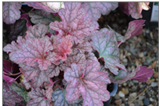
Kira Purple Rain Forest Coral Bells foliage