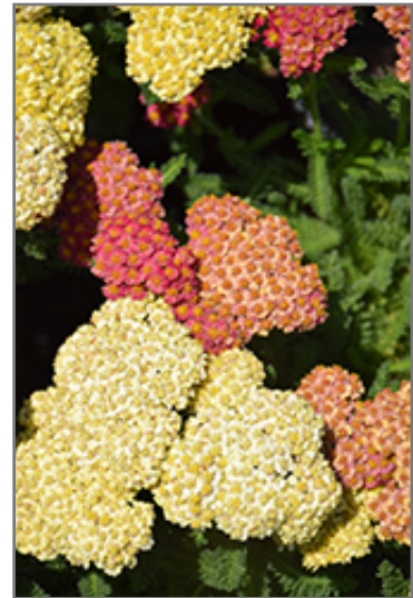
Desert Eve Terracotta Yarrow flowers

Desert Eve Terracotta Yarrow is recommended for the following landscape applications;