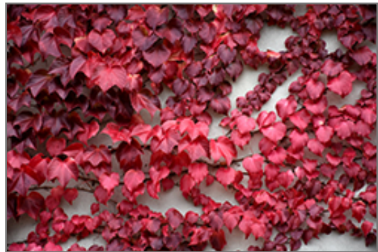
Veitch Boston Ivy in fall