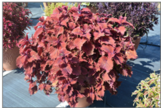
Under The Sea King Crab Coleus