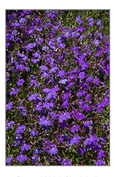
Regatta Midnight Blue Lobelia flowers