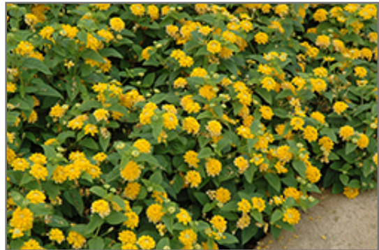
Little Lucky Pot Of Gold Lantana flowers