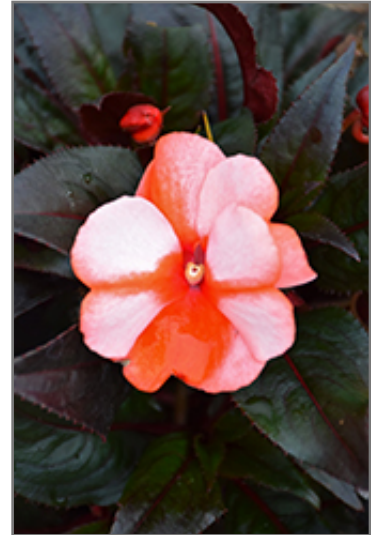
Sonic Sweet Orange New Guinea Impatiens flowers

Sonic Sweet Orange New Guinea Impatiens is recommended for the following landscape applications;