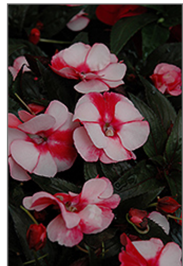
Sonic Sweet Cherry New Guinea Impatiens flowers