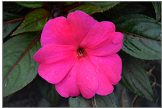
Magnum Blue New Guinea Impatiens flowers

Magnum Blue New Guinea Impatiens is recommended for the following landscape applications;