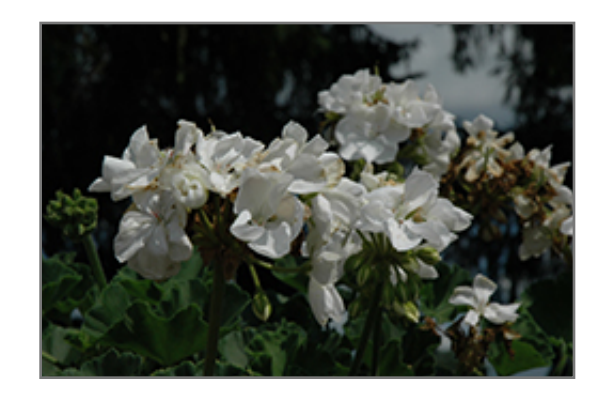
Allure White Geranium flowers