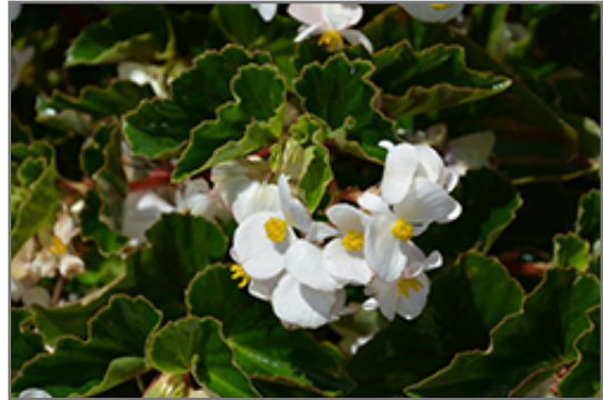
BabyWing White Begonia flowers

BabyWing White Begonia is recommended for the following landscape applications;