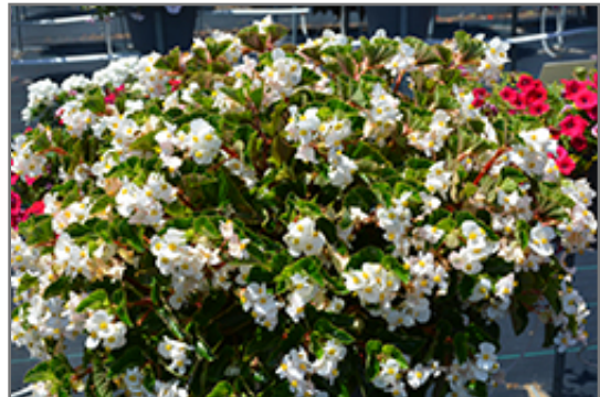
BabyWing White Begonia in bloom