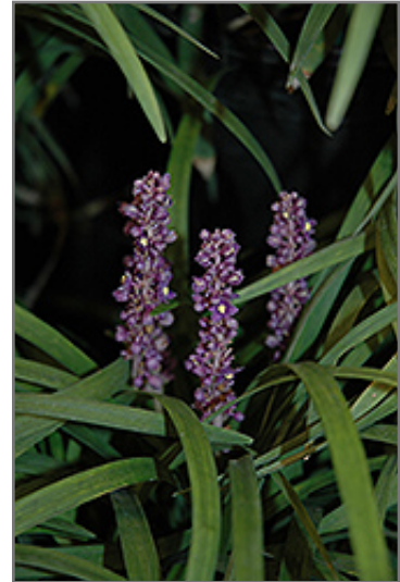
Majestic Lily Turf flowers