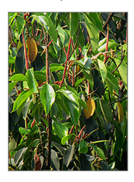
Indian Laurel Fig foliage