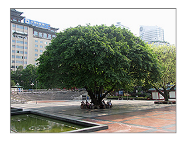
Indian Laurel Fig

Indian Laurel Fig will grow to be about 25 feet tall at maturity, with a spread of 25 feet. It has a low canopy with a typical clearance of 1 foot from the ground, and is suitable for planting under power lines. It grows at a medium rate, and under ideal conditions can be expected to live for 50 years or more.