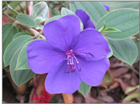
Princess Flower flowers

This shrub will require occasional maintenance and upkeep, and is best pruned in late winter once the threat of extreme cold has passed. It is a good choice for attracting butterflies to your yard. It has no significant negative characteristics.