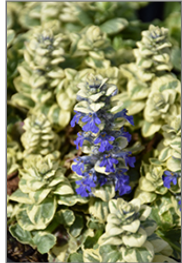
Silver Queen Bugleweed flowers

Silver Queen Bugleweed is a dense herbaceous evergreen perennial with a ground-hugging habit of growth. Its medium texture blends into the garden, but can always be balanced by a couple of finer or coarser plants for an effective composition.