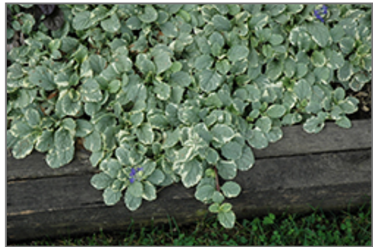
Silver Queen Bugleweed