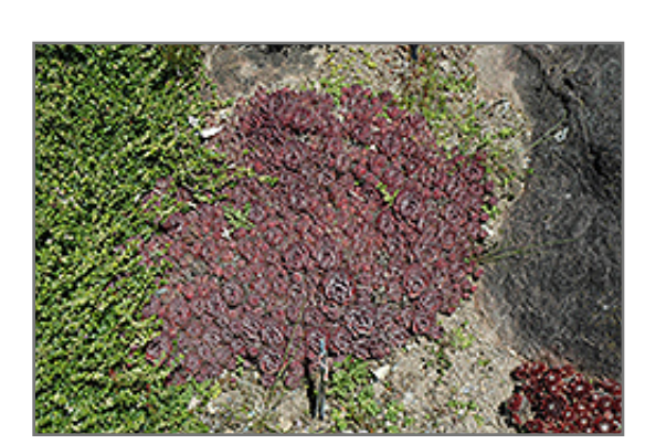
Raspberry Ice Hens And Chicks