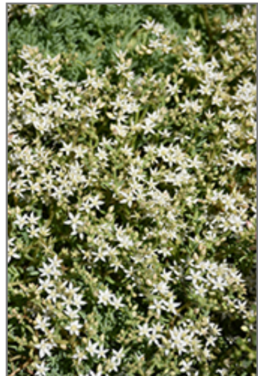
Dwarf Spanish Stonecrop flowers