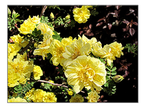
Flore Pleno Rose flowers

This is a high maintenance shrub that will require regular care and upkeep, and is best pruned in late winter once the threat of extreme cold has passed. It is a good choice for attracting bees to your yard. Gardeners should be aware of the following characteristic(s) that may warrant special consideration;