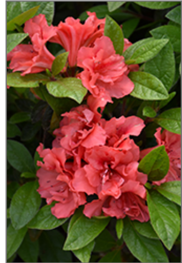
Encore Autumn Monarch Azalea flowers