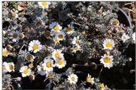
Moroccan Daisy flowers