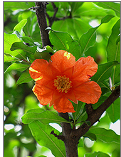
Pomegranate flowers