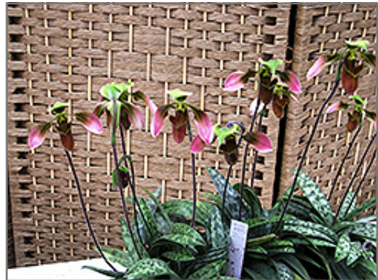
Appleton's Orchid in bloom