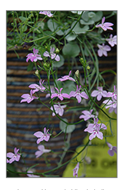
Laguna Heavenly Lilac Lobelia flowers