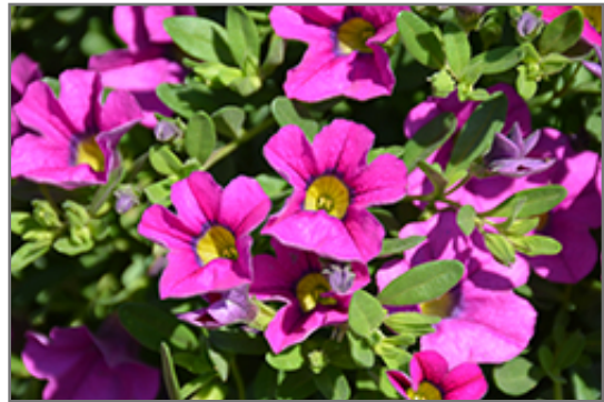
Million Bells Trailing Pink Calibrachoa flowers

Million Bells Trailing Pink Calibrachoa is recommended for the following landscape applications;