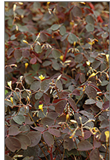
Burgundy Bliss Shamrock flowers