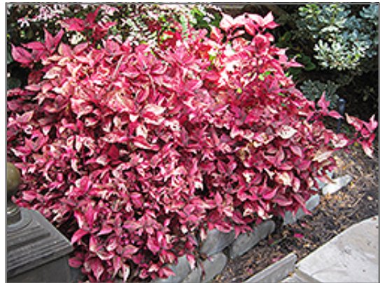
Blood Leaf