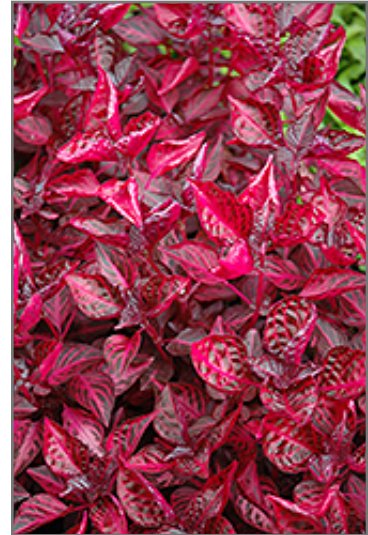
Blood Leaf foliage