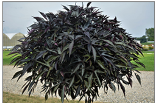
Illusion Midnight Lace Sweet Potato Vine