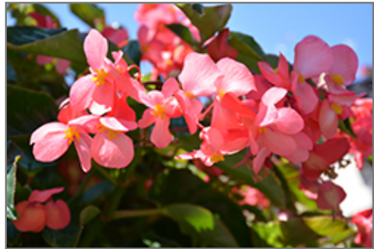
Dragon Wing Pink Begonia flowers

This is a high maintenance plant that will require regular care and upkeep, and usually looks its best without pruning, although it will tolerate pruning. Deer don't particularly care for this plant and will usually leave it alone in favor of tastier treats. Gardeners should be aware of the following characteristic(s) that may warrant special consideration;