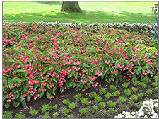
Dragon Wing Pink Begonia in bloom

Dragon Wing Pink Begonia is a fine choice for the garden, but it is also a good selection for planting in outdoor containers and hanging baskets. It is often used as a 'filler' in the 'spiller-thriller-filler' container combination, providing a mass of flowers and foliage against which the thriller plants stand out. Note that when growing plants in outdoor containers and baskets, they may require more frequent waterings than they would in the yard or garden.