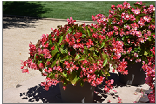
Dragon Wing Pink Begonia flowers