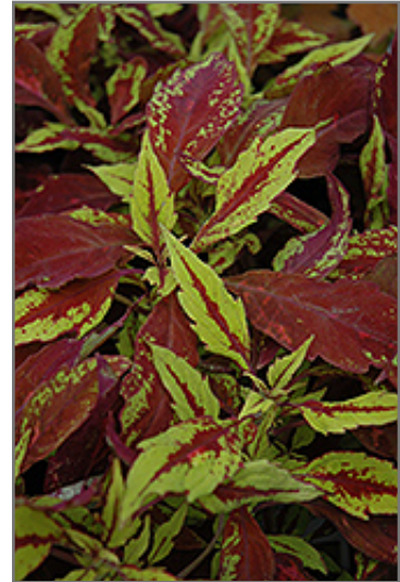
Pineapple Coleus foliage